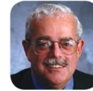
2009 Congressman Gerry Connolly