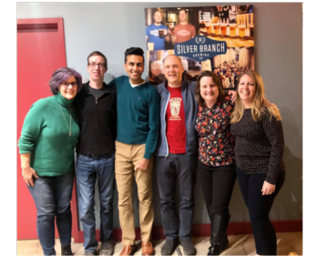
Friends of Forest Glen and Montgomery Hills