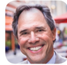
2015 Roger Berliner