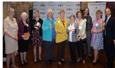
League of Women Voters