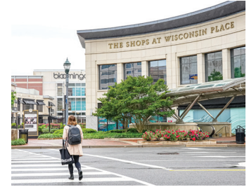
The Shops at Wisconsin Place in front of Bloomingdale's