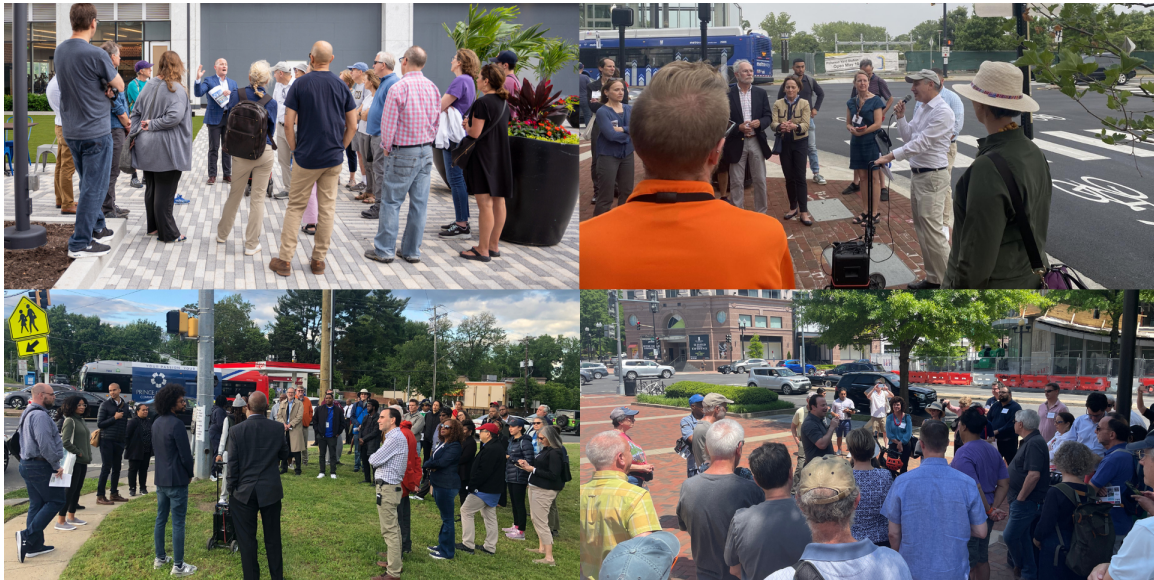
Thanks to Boston Properties for sponsoring our Reston walking tour (top left)!