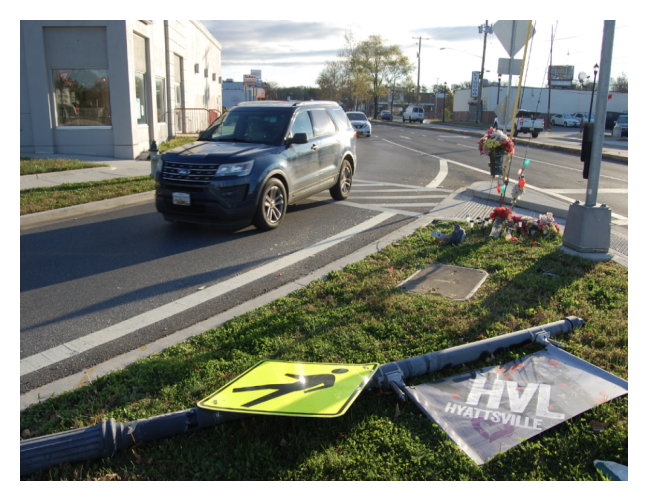
Photo: Rebuilt slip lane at Ager Road and Hamilton Street.

In 2017, Prince George's County developed Urban Street Design standards, which establish safer, lower speed boulevards and local street designs for transit stations and local centers. However, since their adoption, county staff have only partially and inconsistently implemented these standards resulting in overly-wide, high-speed roads in and around mixed-use centers.